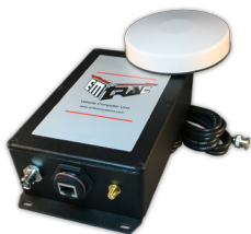
Vehicle Computer Unit

Onboard unit determines train position, transmits location and activity data, and triggers alerts to operators and central personnel when specified conditions occur.