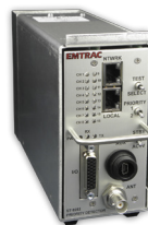
Stationary Detector Unit

Cab-mounted unit displays activity data in real time and alerts train operators of potentially unsafe conditions, such as excessive speed or insufficient block spacing.