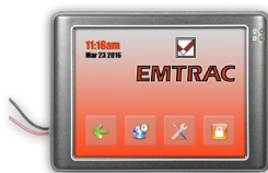
Onboard Control Head

Onboard unit determines train position, transmits location and activity data, and triggers alerts to operators and central personnel when specified conditions occur.